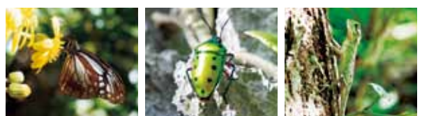
Chestnut Tiger Jewel Bug Ryukyu Tree Lizard