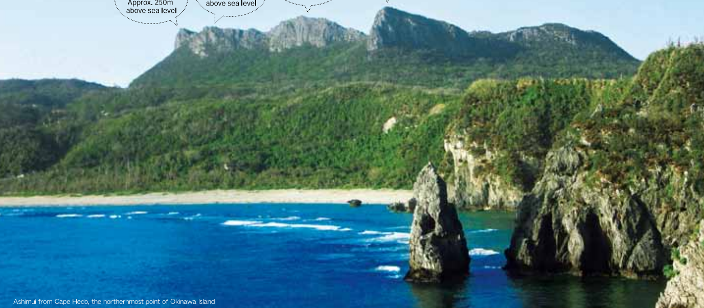
Ashimui from Cape Hedo, the northernmost point of Okinawa Island