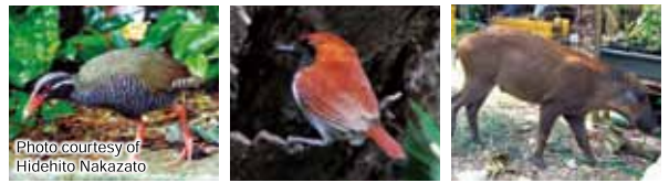
Okinawa Rail Ryukyu Robin Ryukyu Wild Boar