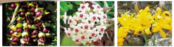
Ilukanda (Rusty-leaf Mucuna) Best in: Mar. - Apr. Wax Plant Best in: June - Sept. Golden Spider Lily Best in: Sept. - Oct.