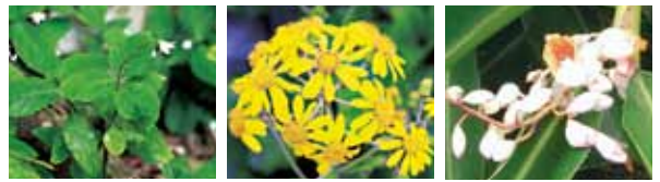
Fewflower Codonacanthus Best in: Oct. - Jan. Japanese Silver Leaf Best in: Nov. - Dec. Shell Ginger Best in: June - Aug.