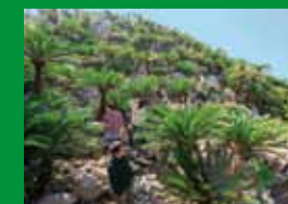
Cycads colony Impressive view of 60,000 Cycads of various sizes standing out of the rocks.

Walk through the dense forest full of subtropical trees and plants, where you can find gigantic Chinese Banyans and a colony of 60,000 Cycads, feeling the power of nature.