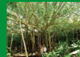
Chinese Banyan of Worship Japan's biggest Chinese Banyan Tree. Kijimuna, a forest elf, witnessed often here.