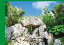
Agai-tida Utaki One of more than 40 worship places in Ashimui area, where Daiseikirinzan is located.