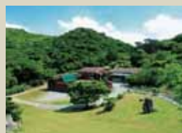
Energy Cabin & Ashimui Café Located at the starting point of Daiseikirinzan Trails.

Energy Cabin with terrace at Central Square offers light meals and drinks made from natural ingredients. Enjoy the scenic view and relax at Ashimui Café in the midst of soothing nature.