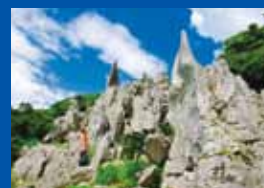
Eboshi-Iwa Rock Intriguing shape formed in 200 million years.

Paved with wooden blocks, elderly people and wheelchair users can enjoy the trail with views of Eboshi-Iwa Rock and Nabe-Ike Pond. Roofed rest station available on the way.