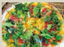
Ashimui Herbs Pizza Taste the specially made herb pizza of wild-grown Sakuna, Njana and Fuchiba.