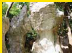
Enmusubi "Matchmaking" Rock Two cuddling rocks for happy lovers.

Walk through the world's northernmost tropical karst topography formed by the limestone layer elevation 200 million years ago. Give your own names to the rocks for their shapes.