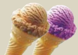
Ice-cream of Okinawan Flavors