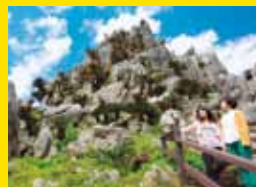
Goku-Iwa "Monkey King" Rock Named after the famous rock of "Journey to the West", the monkey king Son Goku's birth place.