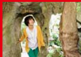
Reincarnation Rock Walking through the rock 3 times is said to bring another life.