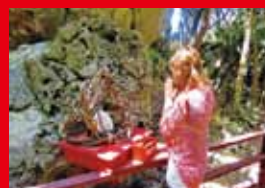
Stone Forest Wall One of Okinawa's biggest power spots with a lot of gods from the heaven and the earth.

Enjoy the splendid view of ocean and Cape Hedo, the northernmost point of Okinawa, as well as Stone Forest Wall and other sacred places.