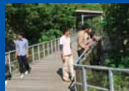
Passage Way Appropriate for children, elderly people and wheelchair users.