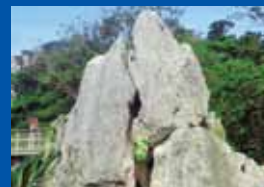
Meoto-Iwa "The Wedded Rocks" Two rocks standing closely, symbolizing a blissfully wedded couple.