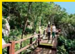
Easy trail An easy-to-walk trekking path.