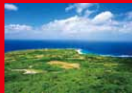
Churaumi Observation Deck Panoramic view of the ocean.